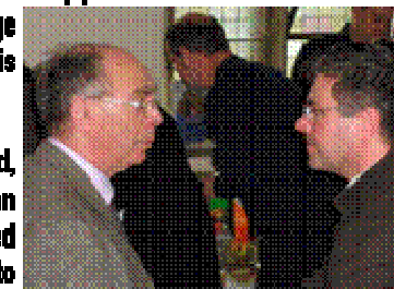
Discussion rages at the conference!

We're pleased to report that 24 people attended, representing 20 different churches and Christian organisations locally and we have already received really positive feedback as people have begun to explore how this might affect their church's work locally.