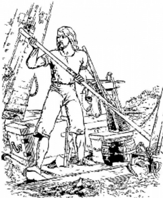
Colour in Paul after the Shipwreck