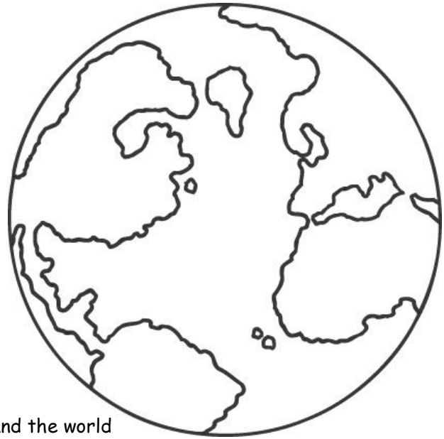
Colour the candle and the world