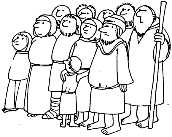
Samuel leads Israel.